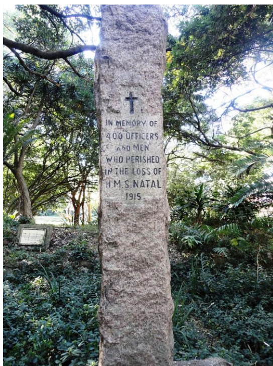
Memorial to deceased of H.M.S. Natal – Durban

A memorial to H.M.S. Natal was erected in Durban in 1927.