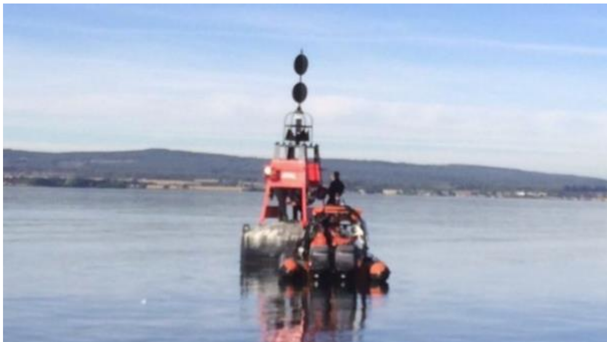
A wreath has been laid at the Natal marker buoy

A buoy marks the site of the sinking today. Much of the steel from the warship was salvaged after the incident.