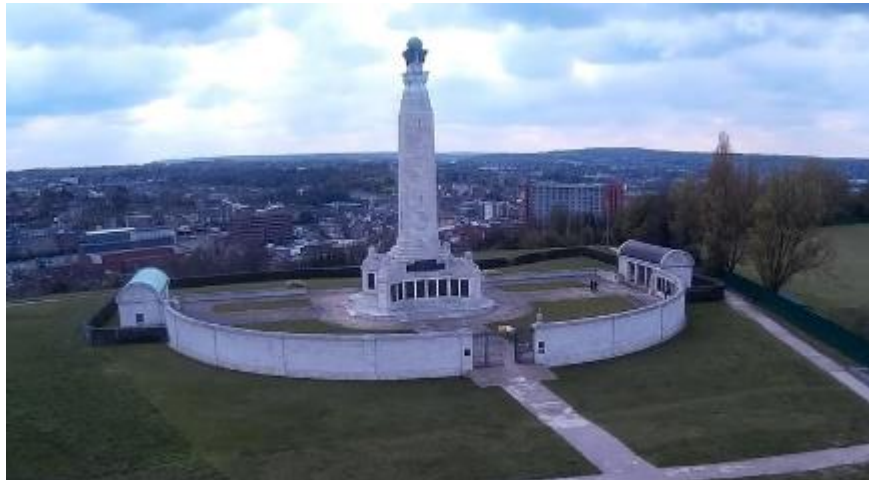
Chatham Naval Memorial