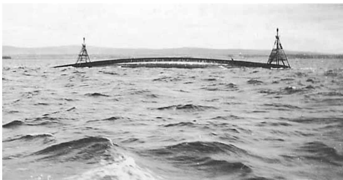
The upturned hull of H.M.S. Natal in Cromarty Firth