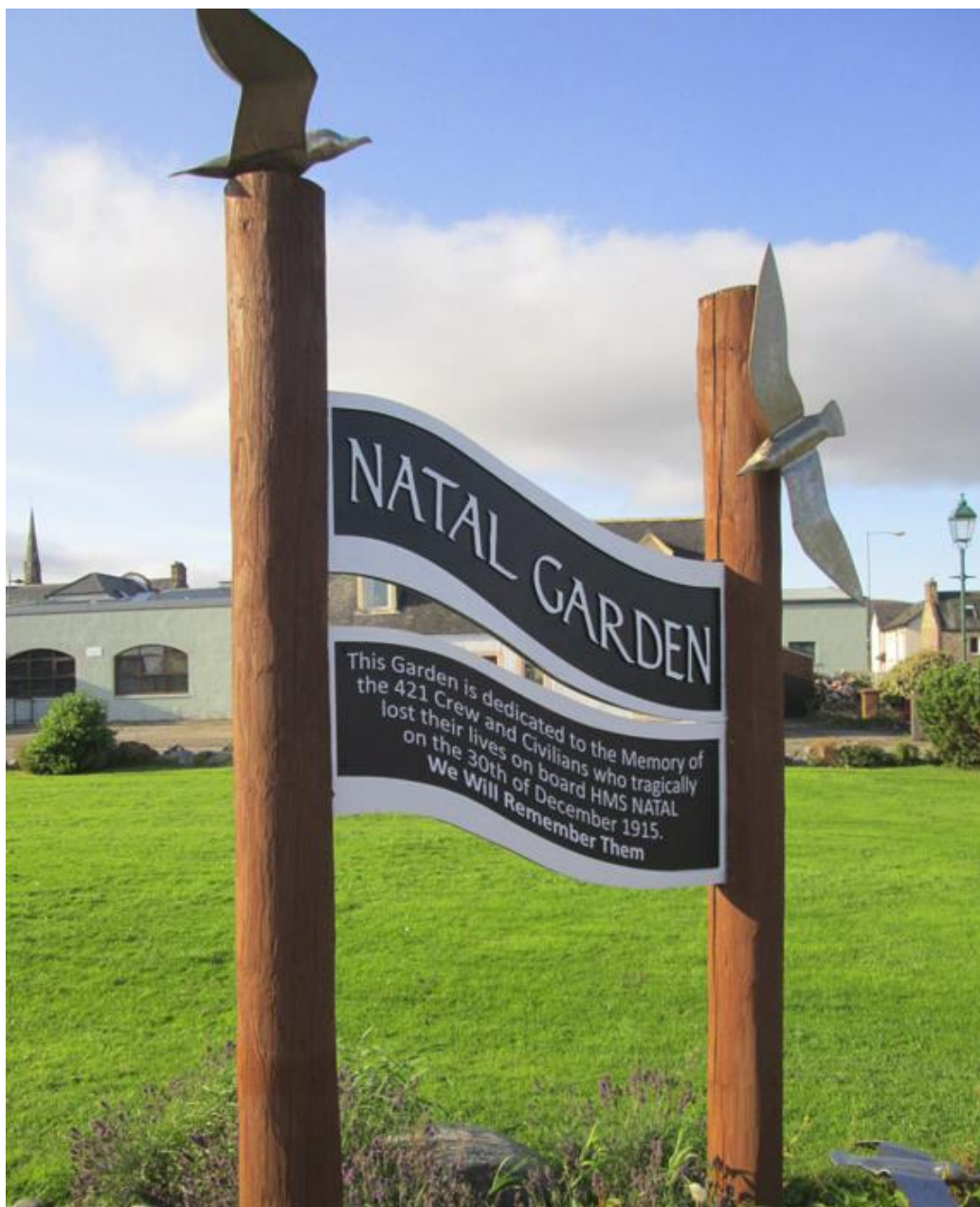
Natal Gardens – Invergordon, Scotland

A garden called Natal Gardens was opened on Saturday 15 July 2000, at Invergordon, Scotland which contains a commemorative plaque remembering Natal . It has a strong maritime theme, including a water feature and a wooden walkway & is tended by volunteers.