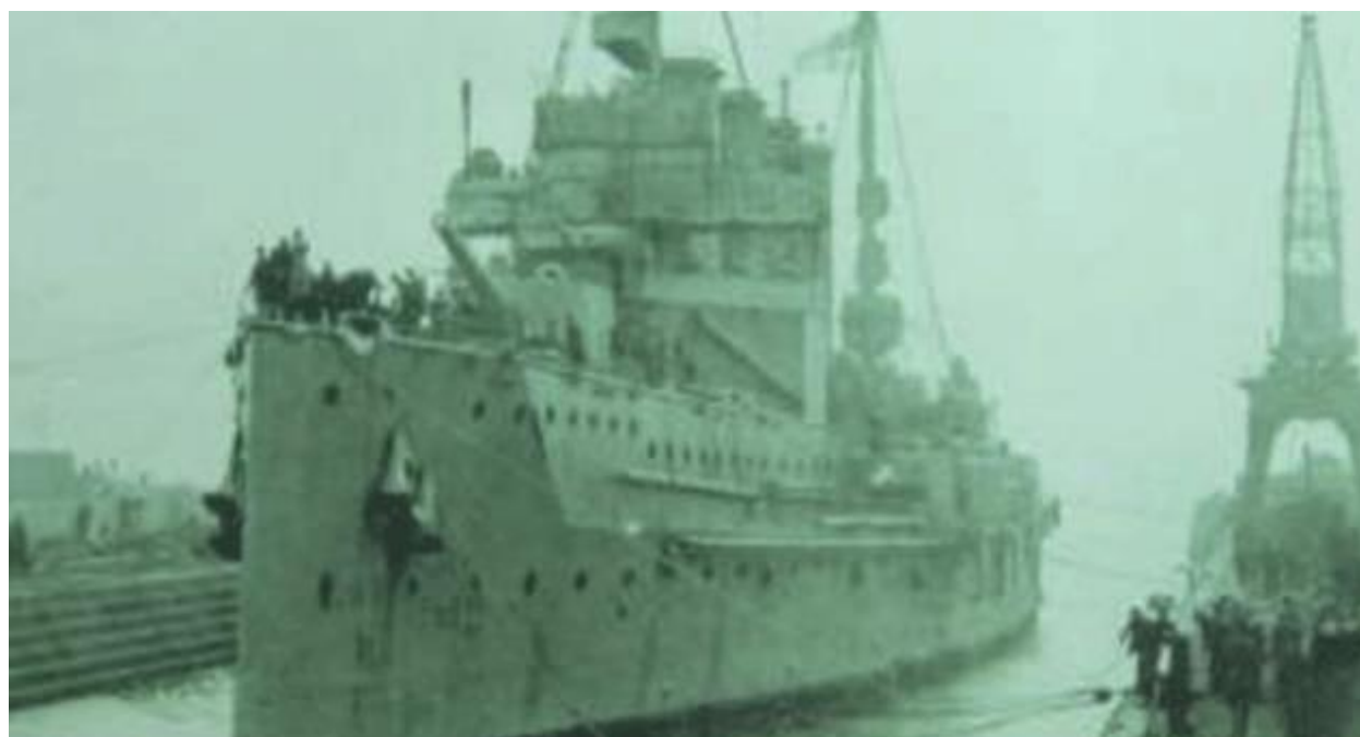
HMS Natal was launched in Barrow-in-Furness in 1905

The loss of 421 people including sailors, women and children when a warship sank during WW1 is being marked by a series of events.