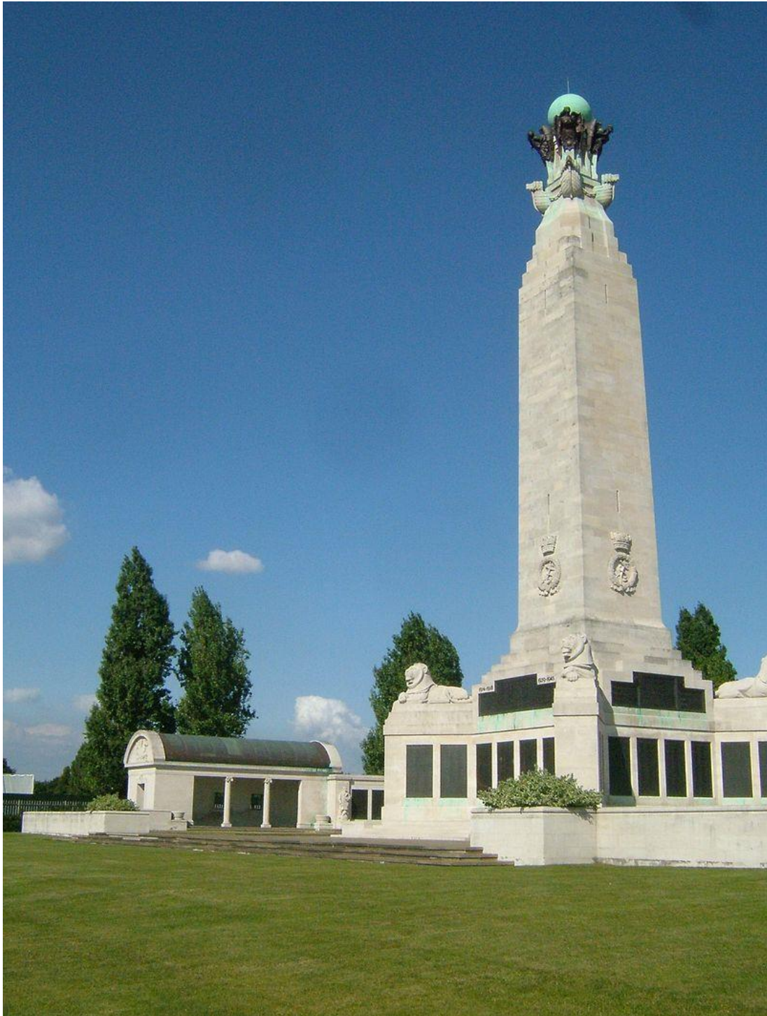
Chatham Naval Memorial

The Chatham Naval Memorial was unveiled by The Prince of Wales, the future Edward VIII, on 26 April 1924.